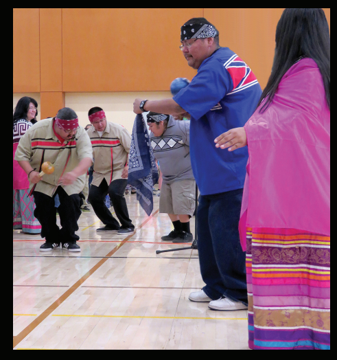
BIRD SINGERS & DANCERS